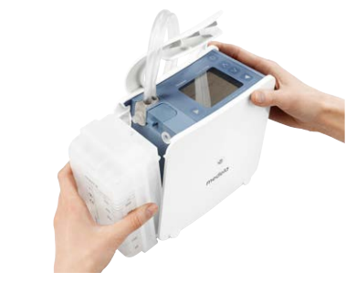
Easy change of canister