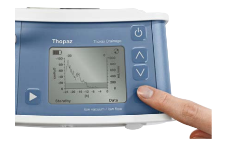
Objective data about the therapy

The simple assembly of the Thopaz tubing and canister, combined with the closed collection of fluids provides staff with an easy to use, hygienic drainage system. The intuitive functionality makes Thopaz simple to operate, and the display of objective, recorded data means clinicians no longer have to estimate the size of air leaks. Together, these features reduce and simplify the work of the clinical personnel.