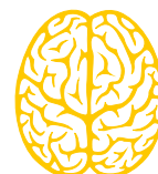
Adult brain 1.45 kg