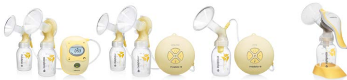
Freestyle™ Swing maxi™ Swing™ Harmony™